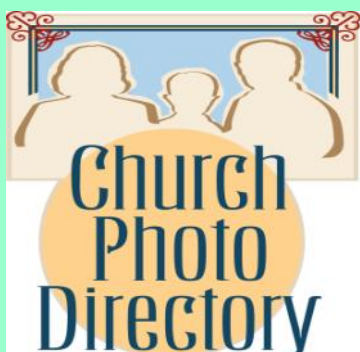
Photo Directory Team